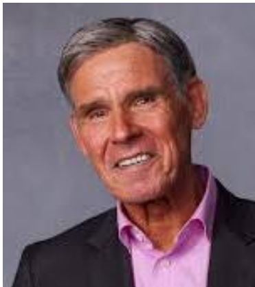
Dr. Eric Topol